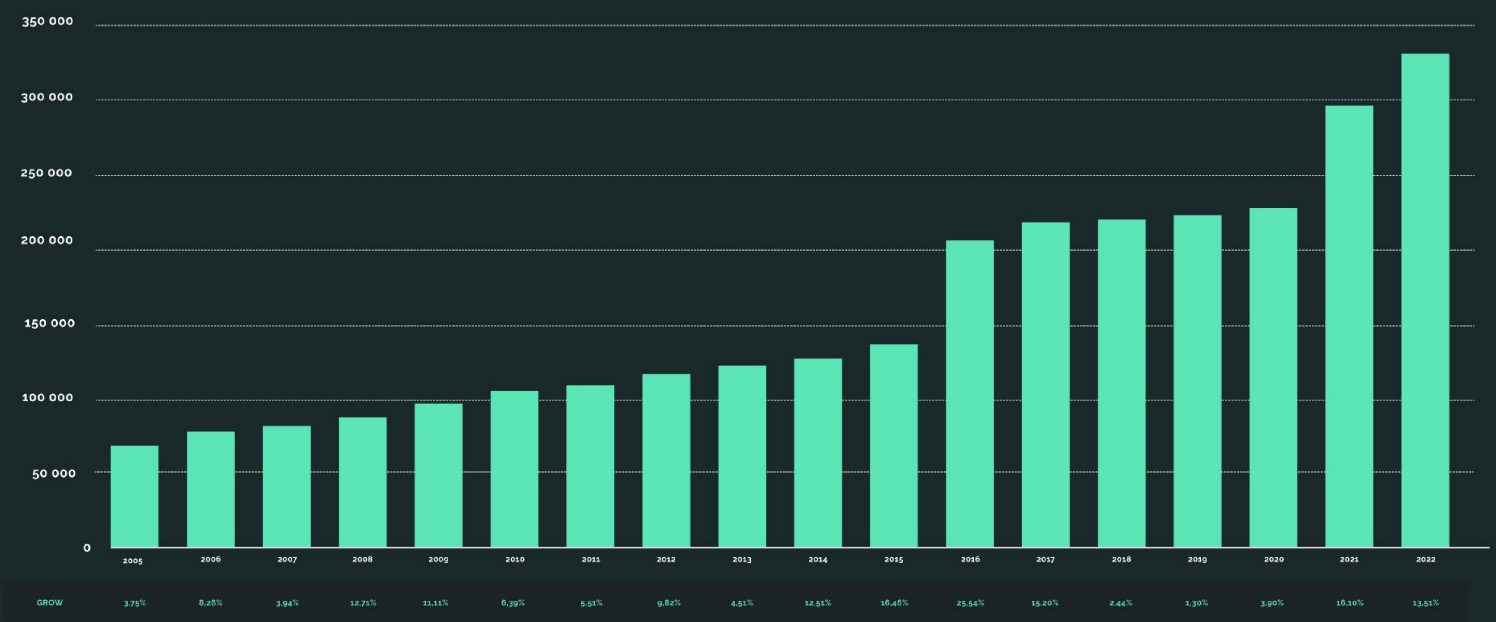
DEVELOPMENT OF MARKET PRICES OF THE SERVICE IN THE PERIOD 2005 - 2022

The agricultural land market in the Czech Republic is practically free of major restrictions on the transfer of ownership to third parties. EU citizens can acquire agricultural land without restrictions. The fragmented ownership of land allows a large number of transactions to be actively carried out even with small areas. All agricultural land for investment is leased by the farmers who farm the land. These entities are obliged to comply with legal norms relating to the protection of the agricultural land fund, the conduct of agricultural activities and compliance with environmental standards for the sustainability and development of the landscape.